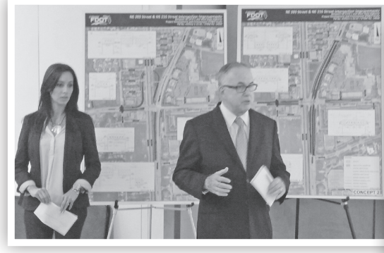
FDOT presents information about proposed Biscayne Blvd and Ives Dairy intersection improvements.

HOA board discusses viewpoints on various community issues.